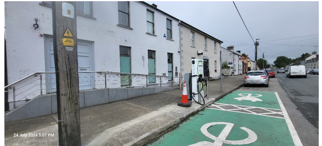
Front entrance ramp and Car Charging Area

Wicklow County Council are proposing to carry out the following development at the Former Bank of Ireland, Main Street, Carnew, Co. Wicklow under Part 8 of the Planning and Development Regulations 2001, as amended. The development will comprise a change of use from the existing bank to a community-based Remote Working Hub intended to provide an active and vibrant working environment on Carnew Main Street.