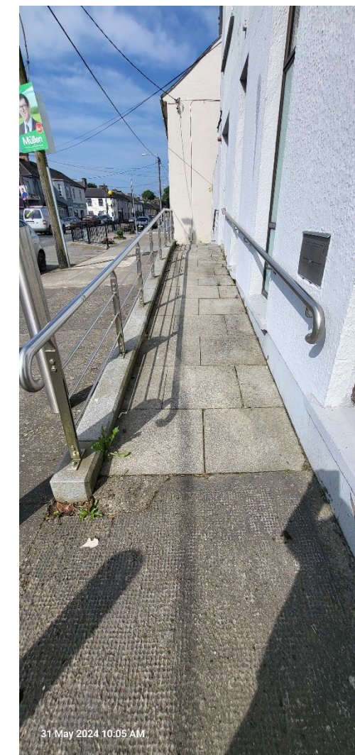
View of existing Ramp