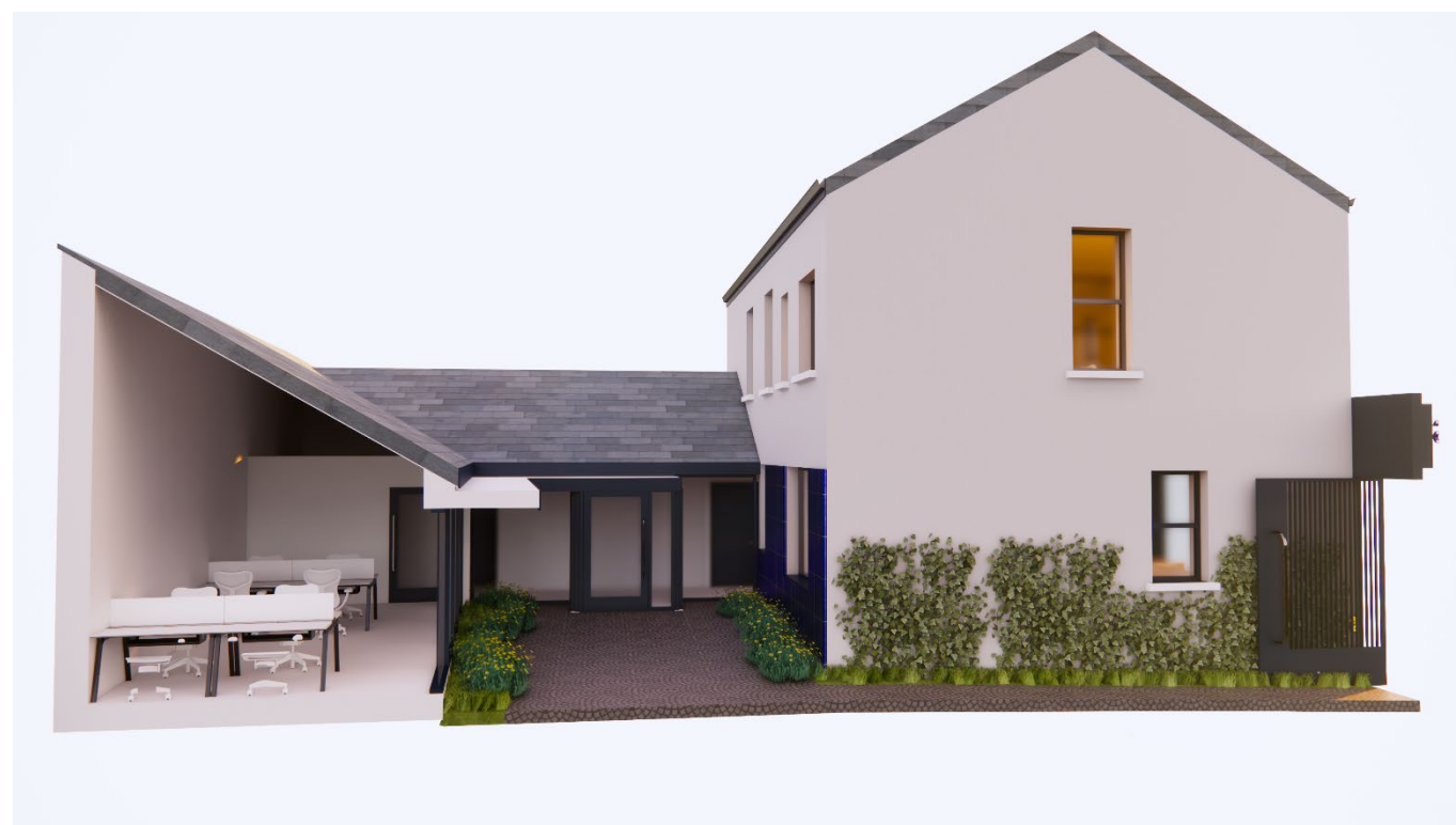
Section showing existing two-storey building and proposed single-storey extension, looking east.

A new extension has been proposed to the rear of the existing yard on the north side of the site.