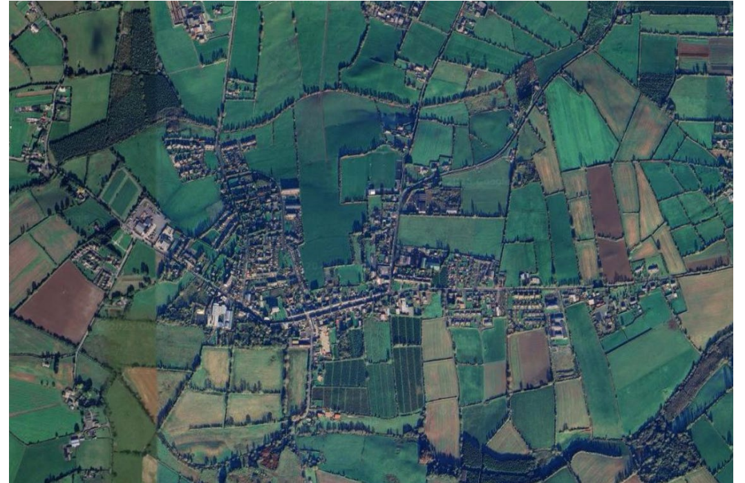
Aerial view of Carnew Village

The site of the Carnew Remote Working Hub is centrally located within the village of Carnew, set directly on the northern edge of Main Street (R725). The area of the proposed development site extends to c. 0.025 ha. and includes an existing yard to the rear and an existing access ramp to the front.