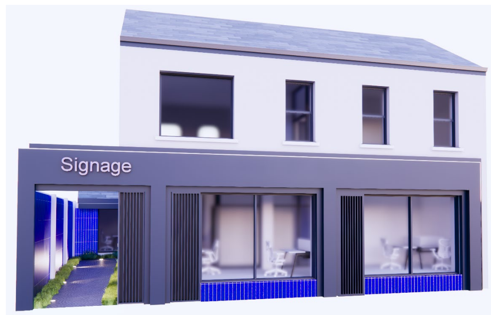
Façade to Main Street

The proposal is that this space will be used with the access to the side of the existing building as an entrance route and as a recreational area. New planting and trellises will be introduced. The area will be repaved with new setts and the existing wall to the west will be treated as a feature with new brightly coloured tiling and external lighting,