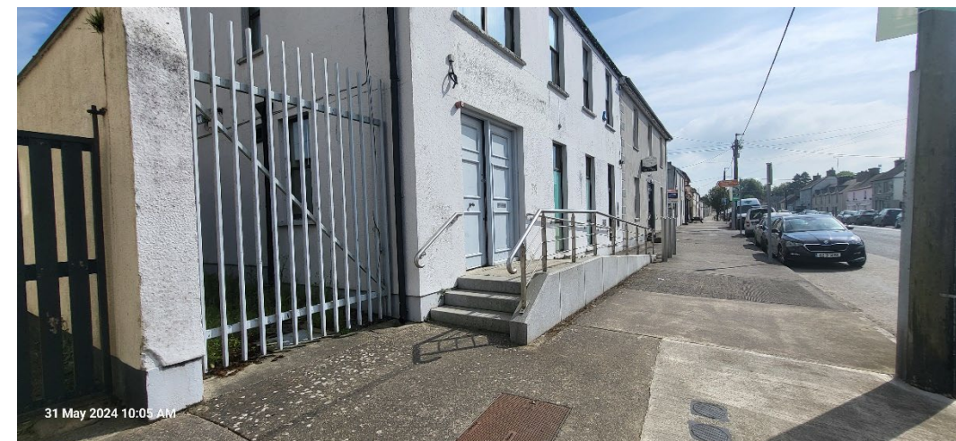
View of side entrance to rear yard

A gated side entrance provides access to the rear yard – this is not wide enough for vehicular access