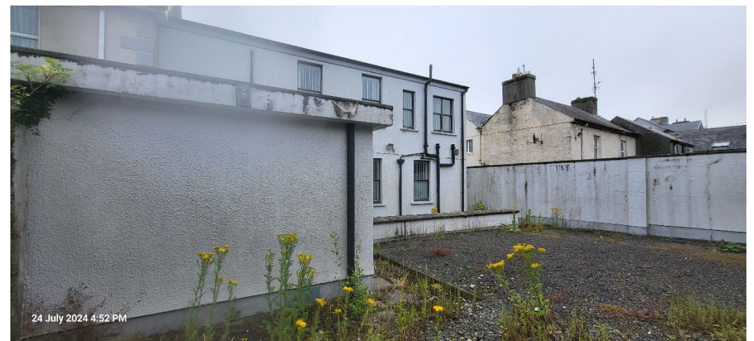
Existing underutilised yard to the rear of the existing building